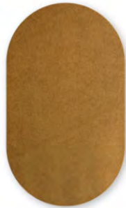
SUEDE E-1656 116