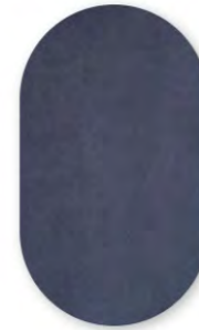
SUEDE E-1656 169