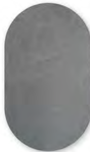
SUEDE E-1656 206