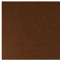
36136 rust rame