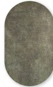
VELVET E-1610 59