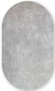
VELVET E-1610 01