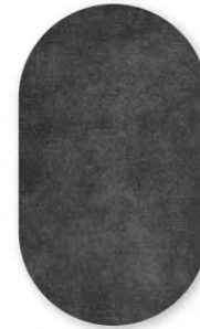
VELVET E-1610 67