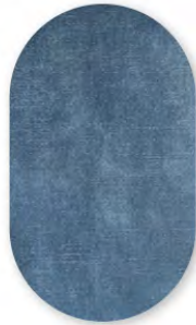
VELVET E-1610 158