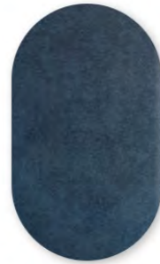
SUEDE E-1656 198