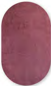
SUEDE E-1656 34