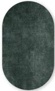
VELVET E-1610 156