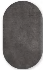
VELVET E-1610 68