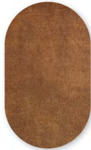
VELVET E-1610 28