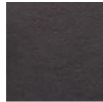
35825 ragg brown