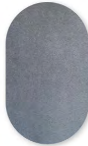
SUEDE E-1656 149