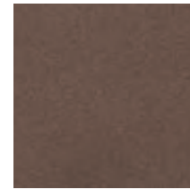
88634 dark bronze