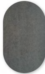
SUEDE E-1656 162