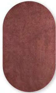
VELVET E-1610 126