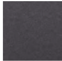
74546 nero akita