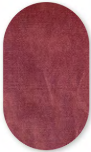
VELVET E-1610 92