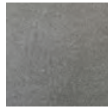
76606 grigio langila