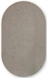
SUEDE E-1656 10