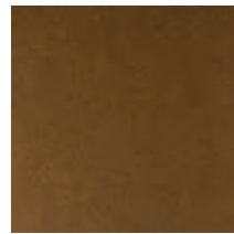
65656 ancient brass