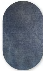
VELVET E-1610 56