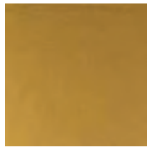
41113 gold karkar