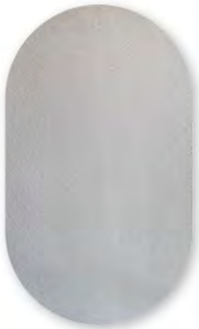
SUEDE E-1656 01